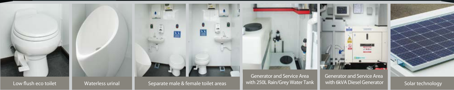
Low flush eco toilet